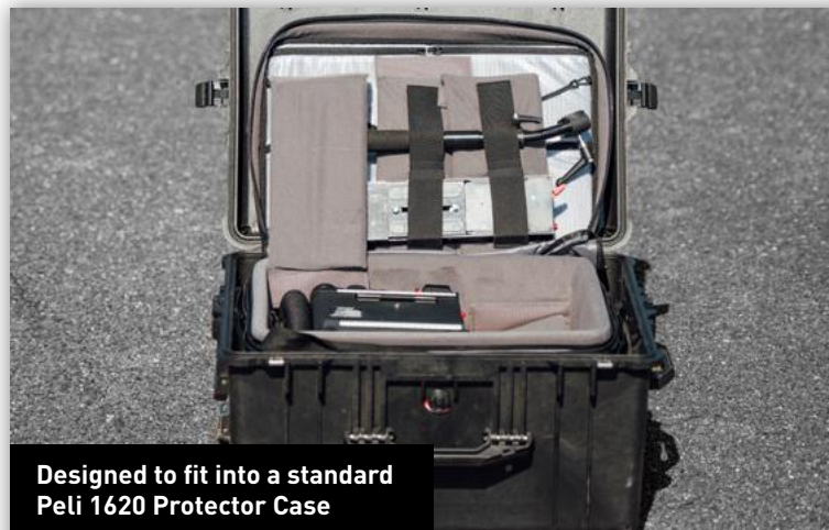
Designed to fit into a standard Pelic Protector Case