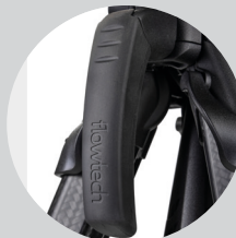
Carry handle S2051-1057