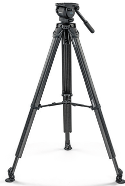
System Vision blue3 FT MS | VB3-FTMS