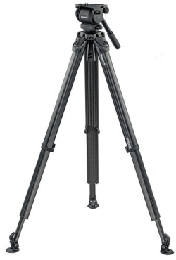
System Vision blue FT | VB-FT