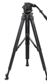
System Vision 8AS FT MS V8AS-FTMS