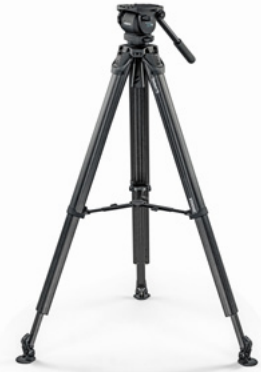
System Vision blue FT | VB-FT